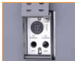
built in power switch and reset switch