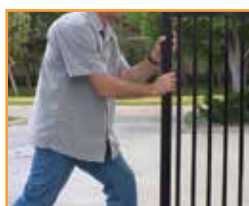
fail-safe release never be locked out (or in)