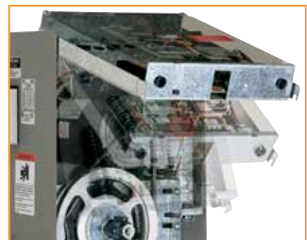
unique design allows easy access to all mechanical parts