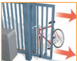
entrapment detection reverses gate when obstructed